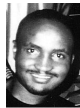
Feb. 4, 1999 Amadou Diallo, 23 Bronx